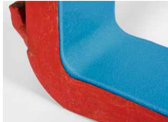
SSC also possible on the back