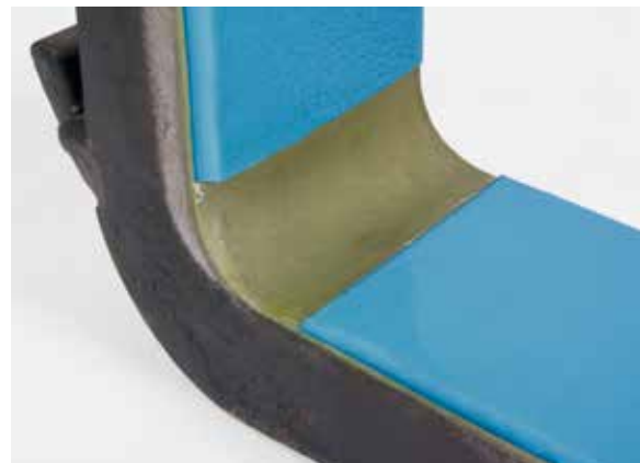
Heel radius free for inspection